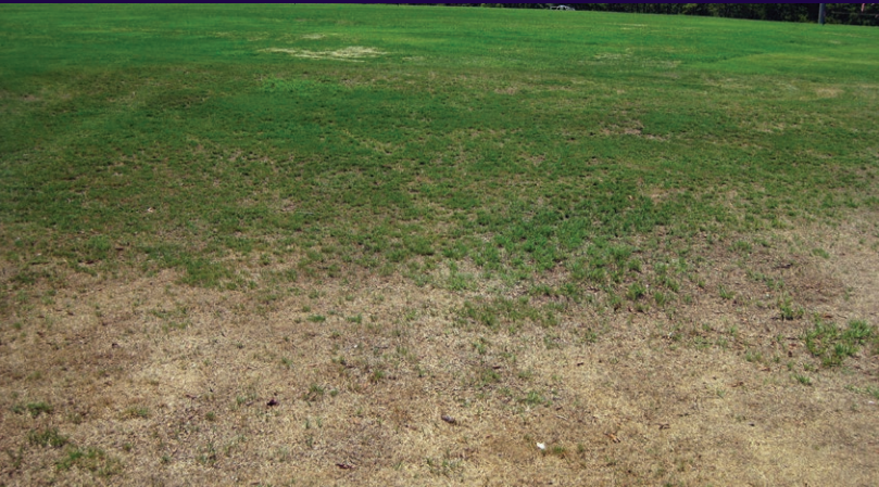
Bear Branch soccer field