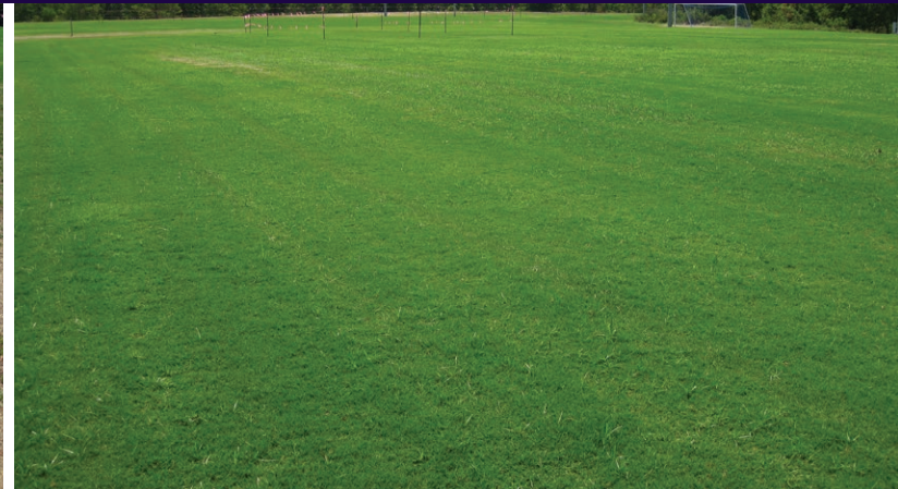
3 weeks later